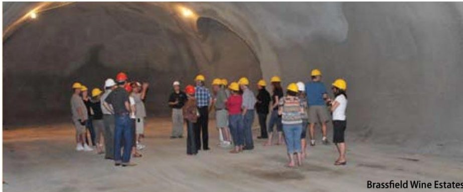
Brassfield Wine Estates