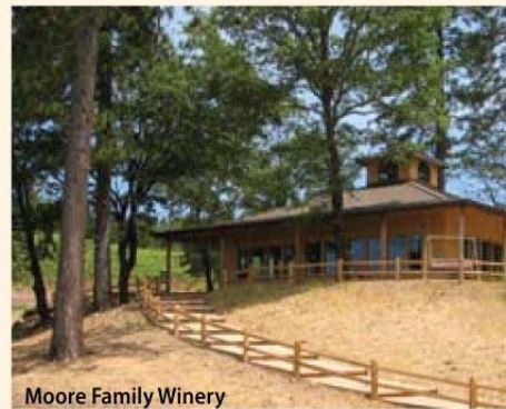
Moore Family Winery