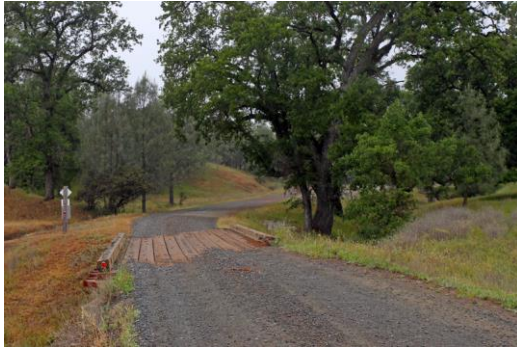
9. Asbill Creek starts in the hills around Michael's Vineyard, then runs under this wooden bridge and continues on the south side of the valley.