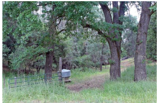
6. Six Sigma pork is raised in the oak land north of Rustici Drive.