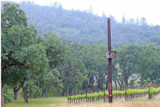
11. Bird boxes in the vineyard attract predators to help us keep the population of ground squirrels down.