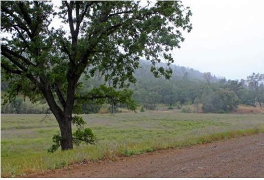
7. Before Norval Brookins relocated the Asbill Creek in the 1950s, it was sprawling all over the valley, all the way to this lonely valley oak growing on the south side of Rustici Drive.