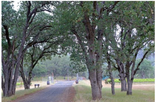
12. A stand of blue oaks leads up to the front gate.