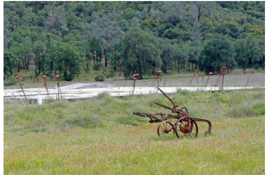
4. Across from the winery is the future site of a hospitality center, with a 5,000 sqft storage cellar underneath. The antique plough in the front was a gift from the Lockman family. It originates from the Copsey family who settled on a part of the ranch by Spruce Grove Road.