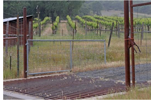
10. The cattle guard keeps cattle out of Michael's Vineyard.