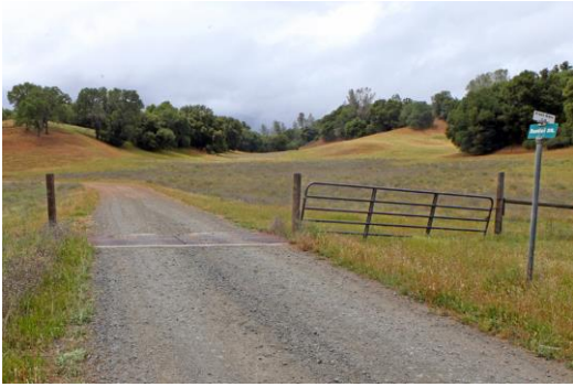
1. After crossing the cattle guard where Rustici Drive meets the private Oak Street, simply follow the road.