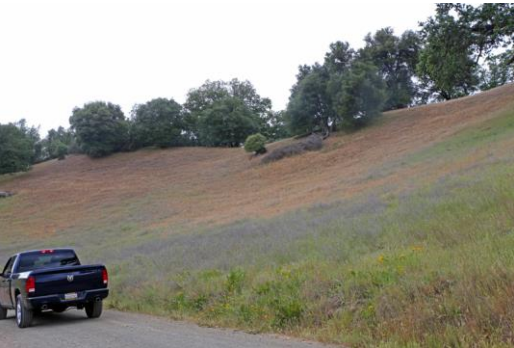
5. Right after the winery you see a bowl-shaped hillside that was used as a grandstand for rodeos and air-shows in the mid-1960s