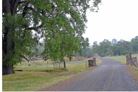
8. The valley oaks by the rock wall are some of the biggest at the ranch. The Creek Trail ends by this wall, and the Winery Trail ends just on the other side of the wall.