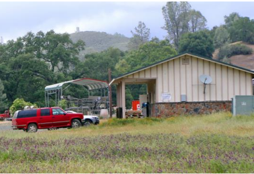
3. The winery is on the north side of the road. We built the first part of it in 2005, and it was ready just in time for crushing our first vintage of Tempranillo