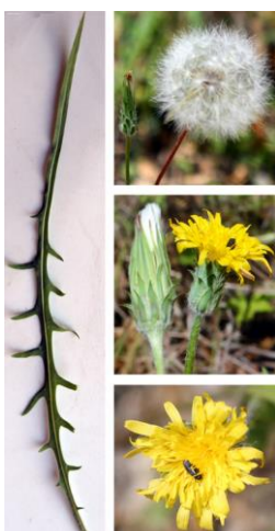
Hawkbit or Hawkweed?