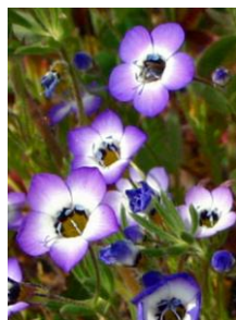
Bird's eyes gilia