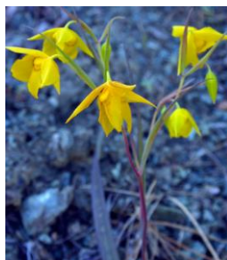
Golden fairy lantern