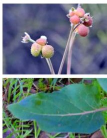
Hounds tongue w/berries