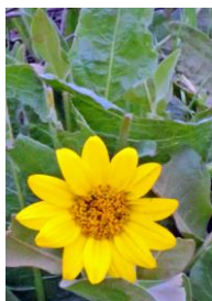
Mule ear, various types