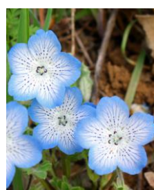
Baby blue eyes