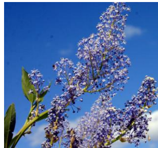
California lilac (shrub)