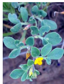
Hill lotus (?)