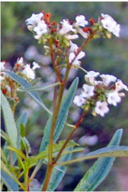
Yerba santa (shrub)