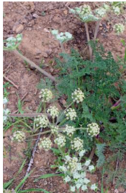
Woolly-fruited lomatium Hog fennel