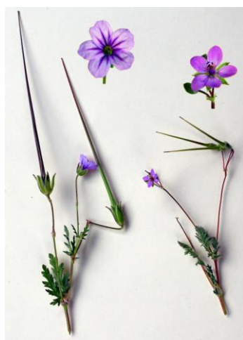
Storksbill, various types