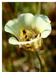
Mariposa Lily