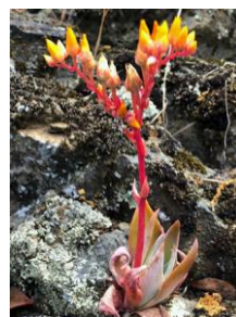
Canyon stonecrop, Dudleya