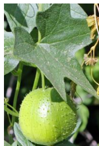
California man-root Wild cucumber