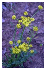
Foothill lomatium, Wild parsnip