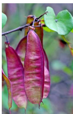
Seed pods on Redbud (shrub)