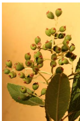
Toyon (shrub) California Holly