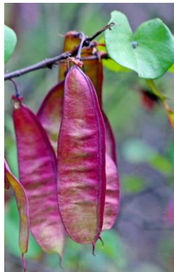
Seed pods on Redbud (shrub)