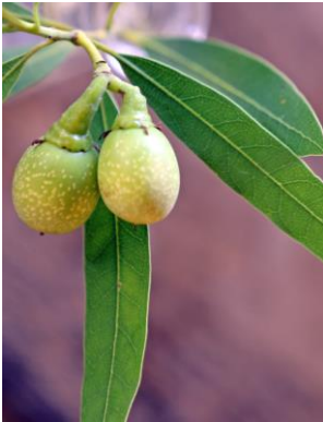
Bay Laurel (shrub)