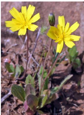
Hairy Cat's Ear, False Dandelion