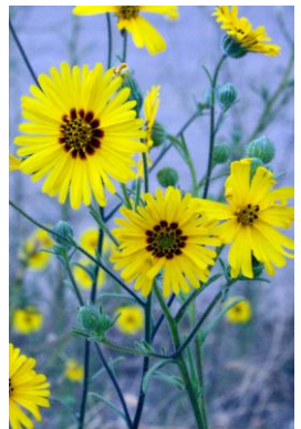
Elegant Tarweed, Madia