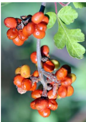
Basket Bush (shrub)