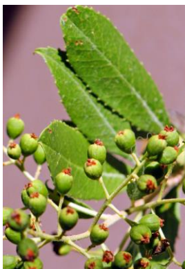
Toyon (shrub) California Holly