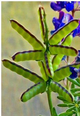
Sky Lupine, seeds