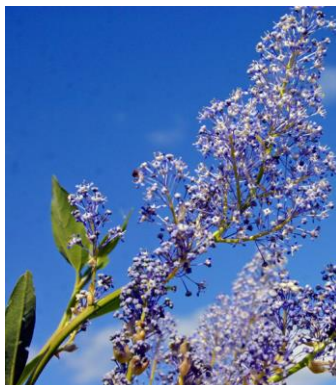
California Lilac (shrub)