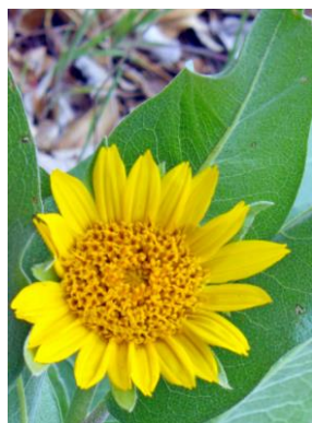
Mule Ears, various types