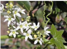
California Man-Root, Wild Cucumber