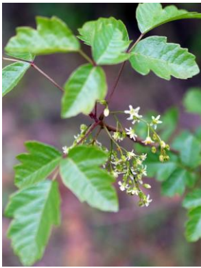
Poison Oak Leaves of three, let them be!