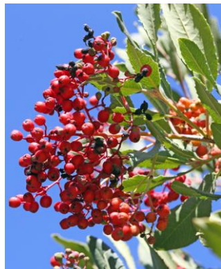
California Holly, Toyon (shrub)