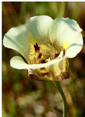
Mariposa Lily