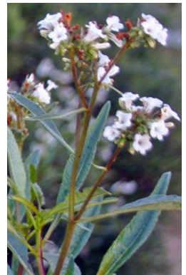
Yerba Santa (shrub)