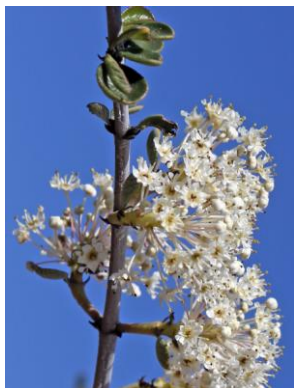
Buck Brush (shrub)