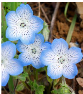
Baby Blue Eyes