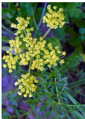
Foothill Lomatium, Wild Parsnip