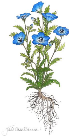
Baby Blue Eyes – N. menziesii

Welcome to the Ranch! We hope you'll have fun watching, identifying and photographing wildflowers.