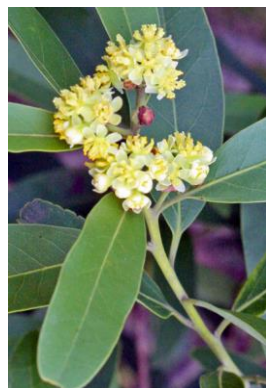
Bay Laurel Tree