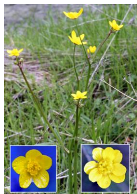
Buttercup Left: Western B. Right: California B.