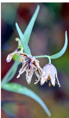
Mission Bells, Checker Lily