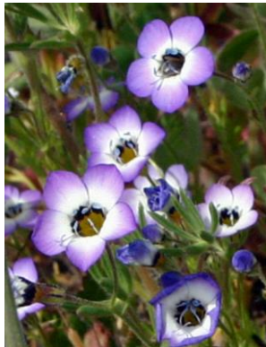
Birds Eye Gilia