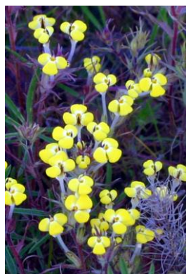
Butter and Eggs