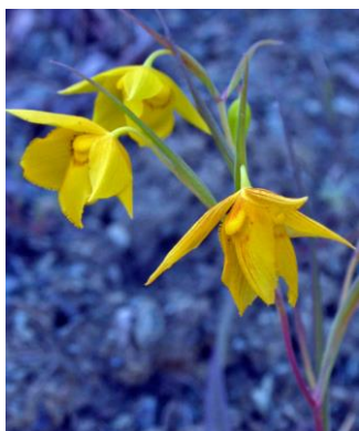
Golden Fairy Lantern