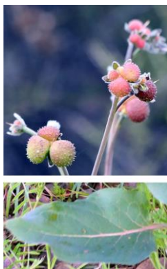
Hound's Tongue seeds