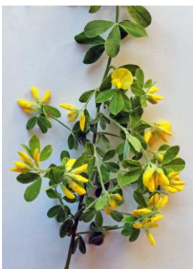
French Broom (shrub)