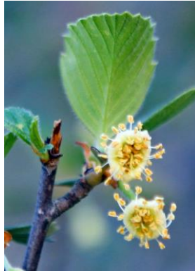
Mountain Mahogany Tree