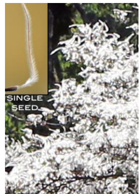
Mountain Mahogany tree with seeds