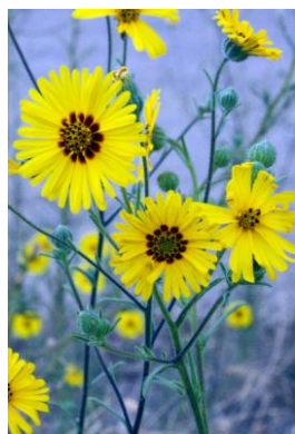
Elegant Madia, Tarweed