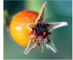
California Wild Rose with Rose Hip