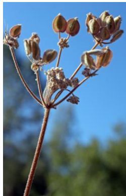
Woolly-Fruited Lomatium seeds