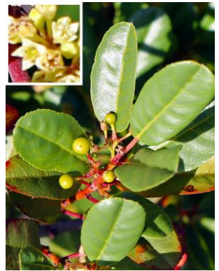
California Coffeeberry (shrub)