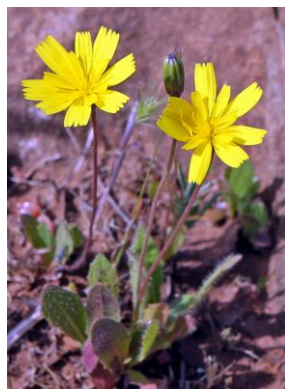
Smooth Cats Ear