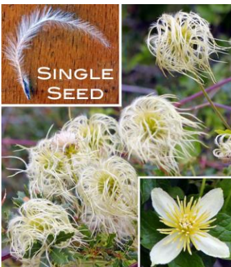
Clematis with seeds