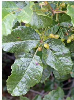
Poison Oak Leaves of three, let them be!