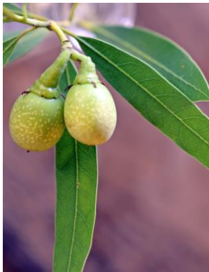
Bay Laurel (shrub)