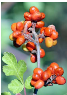
Basket Bush berries (shrub)