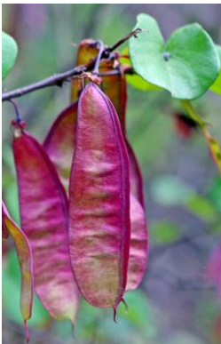
Seed pods on Redbud (shrub)