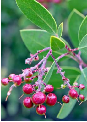
Manzanita berries (shrub)