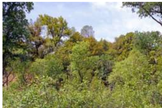
9. On the other side of the crossing, the steep hillsides on the left side of the creek are covered with mixed oak forest...