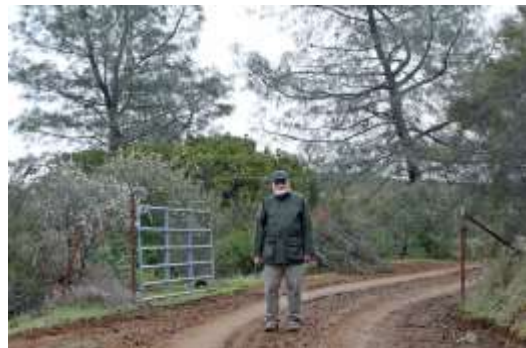
6.. If the gate is closed but not locked, leave it closed and secured behind you. If it is open, leave it open. (0.5 miles from start). If you find the gate locked , please don't continue.