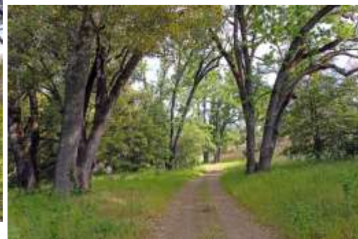
10. ... while big valley oaks thrive on both sides of the road.