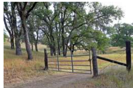
12. The end of the public part of this road is marked by a green cattle gate. Like the first gate, it is surrounded by blue oaks. (1.1 miles total).