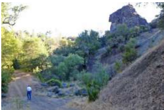
11. The creek crosses the road for the second time, flanked by big rocks. This crossing is also wet in the rainy season, but dries out completely in summer. (1.0 miles).