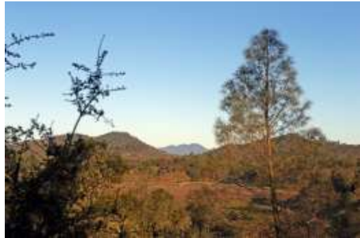
4. Turn around to get a view of Asbill Valley with Mt. Konocti in the distant background. (0.35 miles from start)