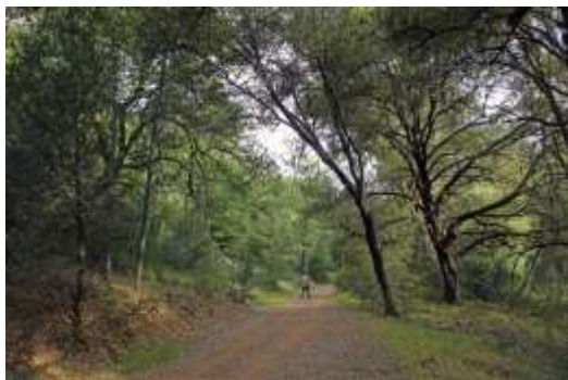
7. As you approach the first creek crossing, you'll see giant oak trees on both sides of the road. Black oaks thrive on the left, and canyon live oaks and interior live oaks on the other side.