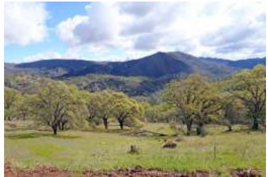
8. Further up the road you get a view of Jim Dollar Mountain. (1.1 miles) The hillside below the road is clad in blue oak.