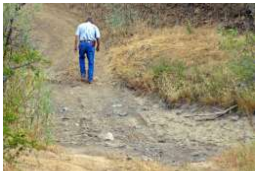
8. The first creek crossing. (0.7 miles). During the wet season, you need serious rain boots if you want to continue. In summer, it dries out completely.