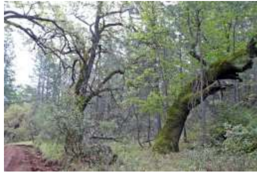
9. Giant moss-covered black oaks grow in this area.