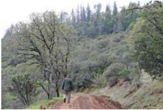
7. About 0.7 mile from start, oak trees appear again.