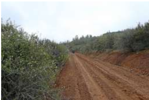
5. Chaparral landscape.