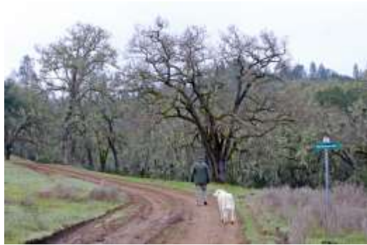
2. The road leads through oak woodland.