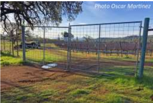
11. The road curves to the right and ends by Christian's Vineyard, 1.6 miles from start. (There is also a road going left, but that part is not open to the public.)