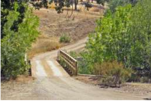
1. Start by the bridge by the Tasting Room.