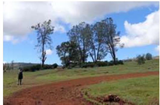
10. The road opens up to a flat area, originally named Schweirs' Flat after two brothers who settled the land in the 1880s. (1.3 miles). Our name for the area is the Diamond Mine.