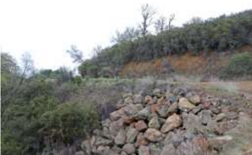
3. After the first curve in the road, the vegetation changes to chaparral.