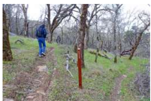
16. At the next sign, you can take the short-cut (Hopper) on the right side (cutting off 0.3 miles), or continue uphill towards Middle Earth to the left.