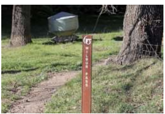
16. Wilbur Pass is another access point on Rustici Drive.