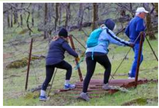
14. Follow the trail to the right along the creek. Soon you'll get to the first trail cattle guard. (Please note: It takes good coordination to cross these, and they are not recommended for dogs).