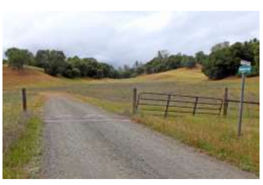
1. After crossing the Main Cattle Guard where Rustici Drive meets the private Oak St., simply follow the road.