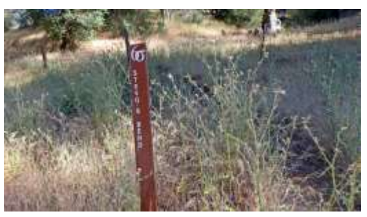
17. The last segment of The Edge is Stevo's bend, constructed by Steven Beckstead. From this, you can access Kaj's Winery Trail as well as The Edge.