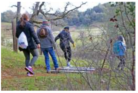
18. ... and cross the next trail cattle guard to make it back to the Creek Trail. (0.7 miles total).