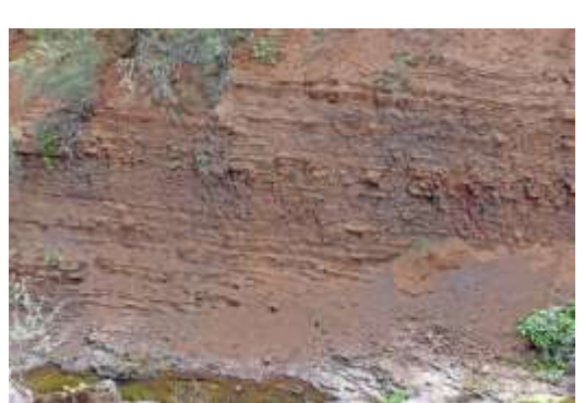
3. ... almost vertical walls of layered rock