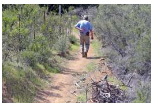
9. The landscape changes to chaparral, and the trail now continues on the right side of the fence line. (About 1.8 mile from start).