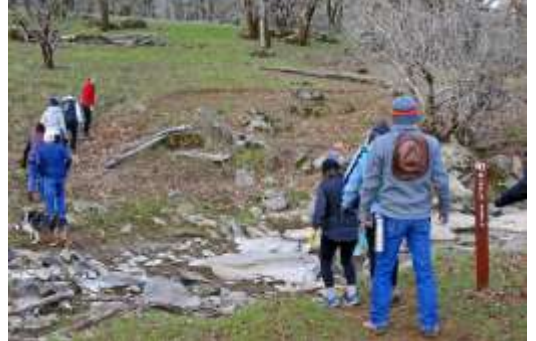
7. Then, (0.3 miles) a sign shows where you can cross the creek to access Middle Earth and Else's Valley Trail. ( pic. #13-24)