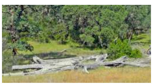
11. Close to the end of the trail you'll see several weathered tree trunks at the other side of the creek. These trees were cut down to make space for a short canal that serves as an important part of the relocation project.