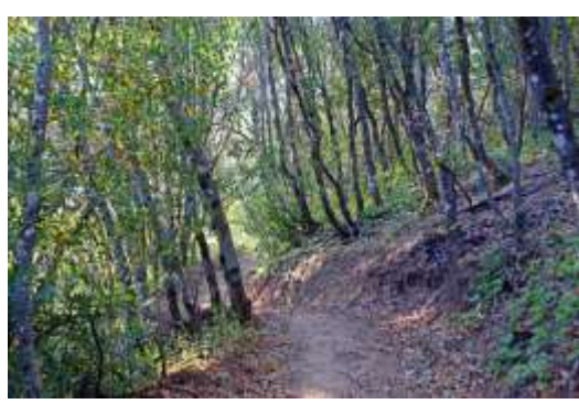
8. The Winery Trail leads uphill through a mixed forest that is home for tall stands of fragrant California bay laurel trees.