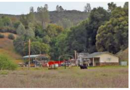
6. You see the winery across the valley on your right.