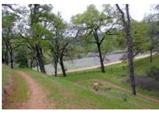
10. After a steep descent, the trail meanders with hairpin turns and ups-and downs on the north side of Rustici Drive. You can exit the trail at Stevo's Bend (2.2 miles from start) and get back to Rustici Drive...