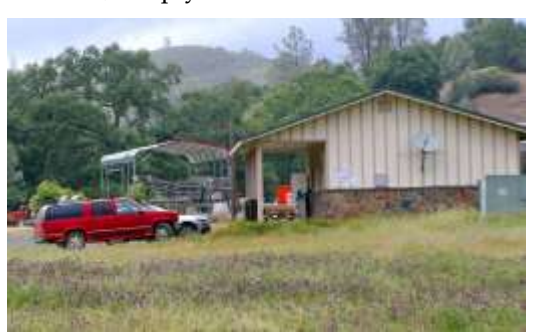
3. The winery is on the north side of the road. We built the first part of it in 2005, and it was ready just in time for crushing our first vintage of Tempranillo.