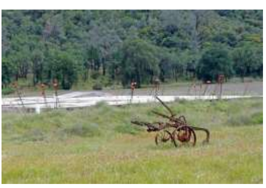
4. Across from the winery is our 5,000 sqft storage cellar, The Barrel Room . The antique plough in the front was a gift from the Lockman family. From the 1920's, it originates from the Copsey family who settled on a part of the ranch by Spruce Grove Road.