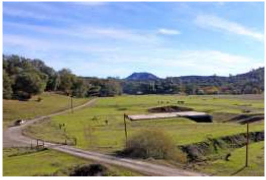
14. The climb is worth the effort – the view from the top of the Grandstand is amazing. (This bowl-shaped hillside was used as seating for rodeos in the 1960s.) After the Grandstand, the trail turns right, running above a deep valley, then heads back towards Rustici Drive.