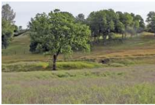
10. The creek used to meander all the way to this lonely Valley Oak by Rustici Drive.