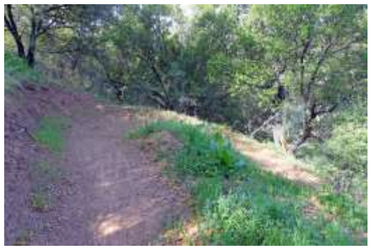
4. ... then meanders downhill into the long valley behind the winery...