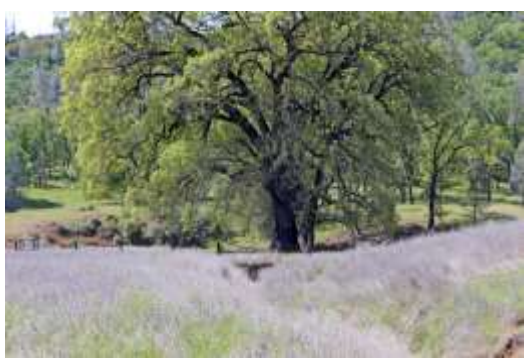
11. ... or continue until you get to a path that runs along a drainage ditch toward the giant Valley Oaks and the Rock Wall on Rustici Drive.