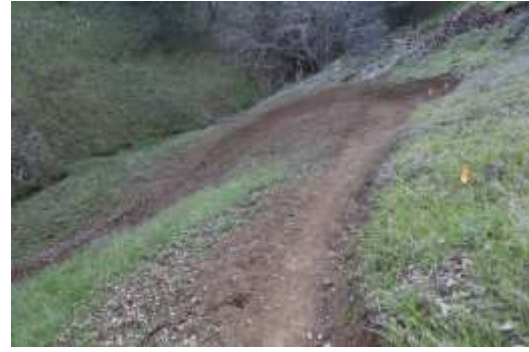
20. ... then heads downhill after a dramatic curve. (0.25 miles)