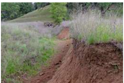
9. The Creek Trail offers an insider's look at a project done in the 1950s by a former owner, Norval Brookins: Relocating Asbill Creek from its meandering path in the middle of the valley to an out-of-the way location along the south side. A few drainage ditches (here 0.7 miles) were part of the project, leading rainwater directly to the creek from the hills on the north side of the valley.