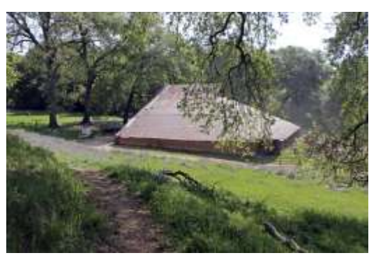
2. The trail leads around the cattle barn where giant Valley Oaks thrive by a seasonal stream. (About 0.4 mile from start)