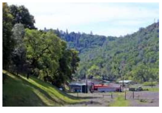
6. Before the trail heads west, you get a distant glimpse of the backside of the winery. (About 1.2 mile from start).