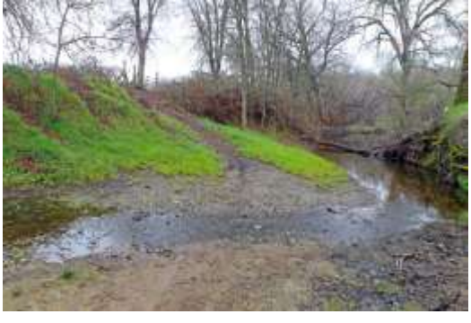
24. Cross the creek, then follow the trail to the left to make it back to the Creek Trail. (0.9 miles total)