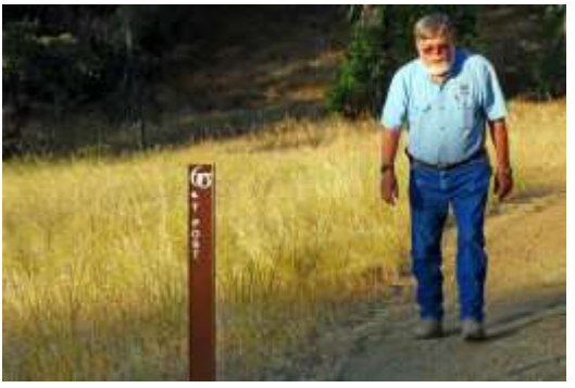
7. About 1.5 miles from start is the T-Post shortcut that can take you back to Rustici Drive in 0.4 miles.