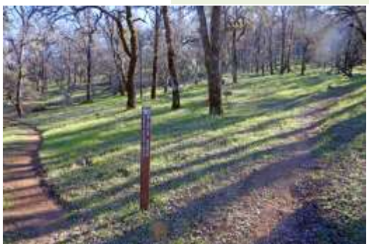
19. Start – like for Middle Earth – by crossing the creek and follow the trail. By this sign, choose the left trail that runs in the hills above Asbill Creek...