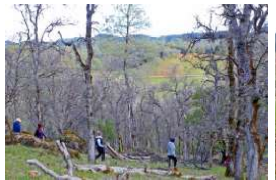
17. The top of Middle Earth offers a view of Asbill Valley. Follow the trail downhill...