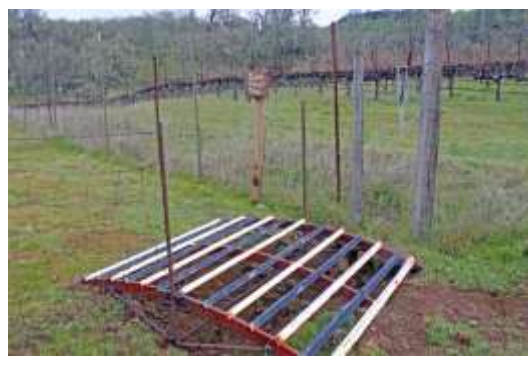
22. ... and cross the trail cattle guard by the sign Else's Valley Trail . (0.6 miles). Now, you can either continue along the vineyard fence to the road, then follow that and cross the bridge close to the Tasting Room. (0.9 miles total)