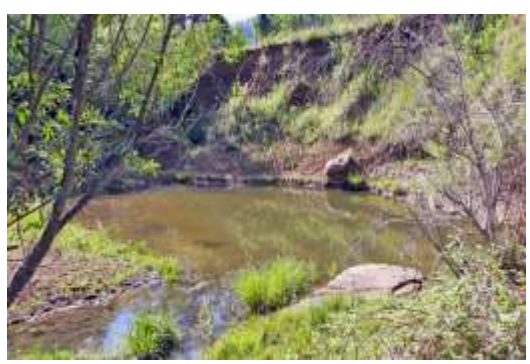
4. ... an all-year waterhole