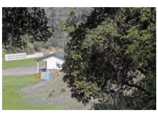
3. You get a glimpse of the winery (0.6 miles) before the trail continues into the hills on the east side of the winery...