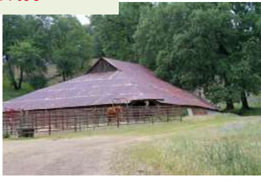
2. The barn on the north (right) side of the road was built by Norval Brookins who gathered almost the entire ranch between 1926 and 1963.