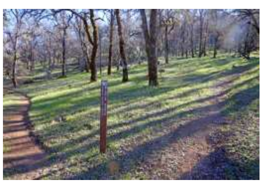
15. The sign after the trail cattle guard points to the right towards Middle Earth.