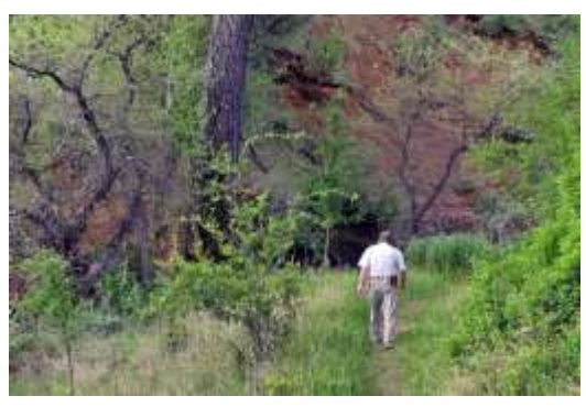
2. The trail curves slightly to the left (0.15 miles) and continues downhill to the creek. The trail offers some interesting looks at the landscape such as...