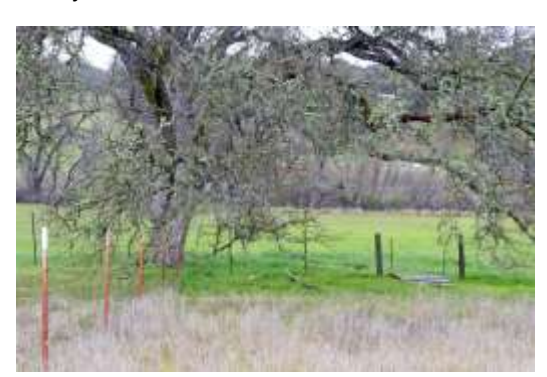
23. ... or make a left and head towards the big Blue Oak in the field. Cross two more trail cattle guards and climb down the steep embankment to Asbill Creek.