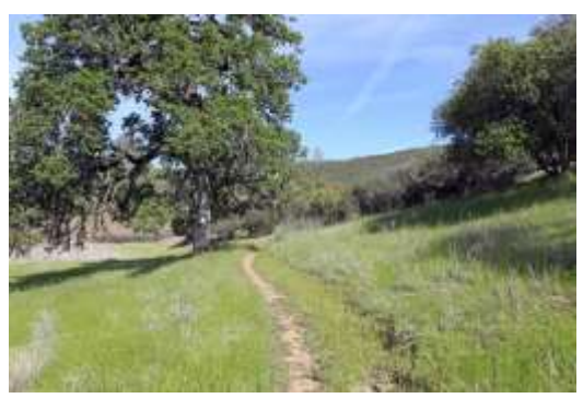
5. ... through oak land and chaparral.