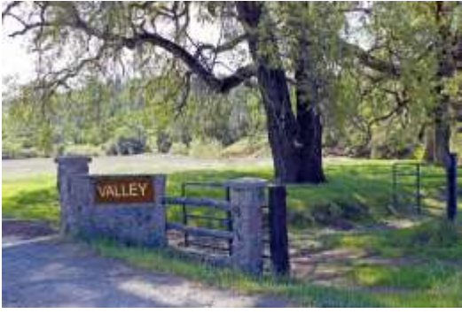
12. The Winery Trail ends by the Rock Wall, after a total of 2.7 miles.