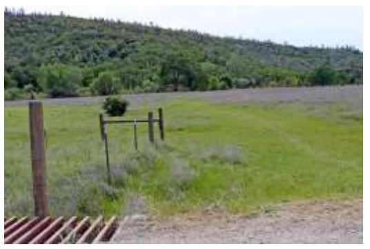
1. Start by the Main Cattle Guard where Rustici Drive meets the private Oak Street. Follow the south trail across the field towards Asbill Creek (named after the first family settling in the valley around 1860.)