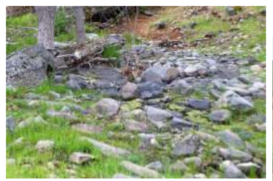
5. ... rocky creek beds that dry out and sport various grasses as soon as there's a break in the rain in the rainy season