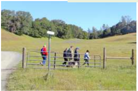
1. Start by the Main Cattle Guard where Rustici Drive meets the private Oak Street. Follow the north trail across the field and into the hills clad with Live Oak and Blue Oak.