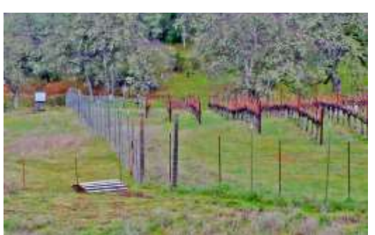
21. After passing through an area with Blue Oak forest, the trail heads towards Else's Vineyard. Follow the trail along the vineyard fence...