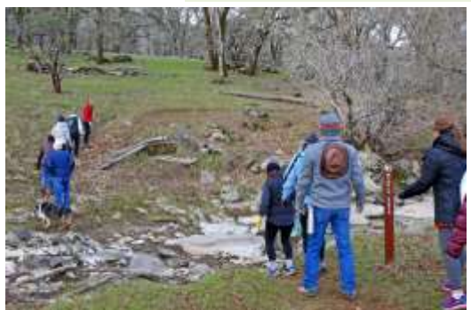
13. To get to the trails on the south side of Asbill Creek, cross the creek by the sign shown in pic #7 on the previous page.