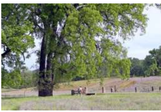
12. The trail ends by the giant Valley Oaks and the Rock Wall on Rustici Drive. (1.1 miles from Main Cattle Guard).